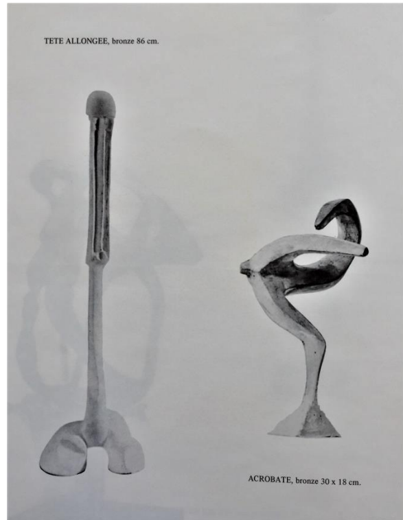
Relief Mask bronze 48 cm / Elongated Relief bronze 61 cm # Elongated Head bronze 86 cm / Acrobat bronze 30x18 cm