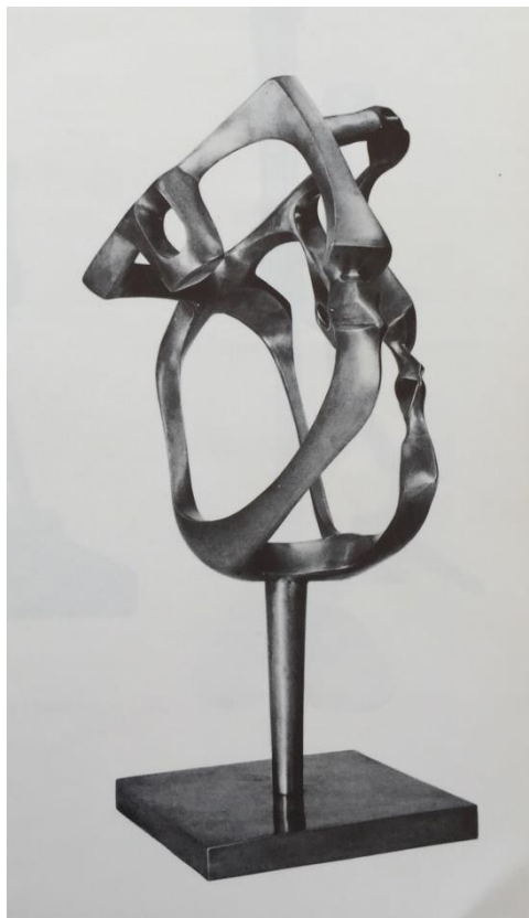
"Double Head" bronze - 43x43 cm