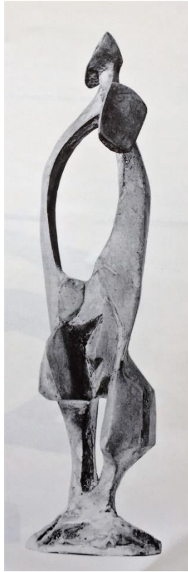
"Couple I." bronze - 37 cm