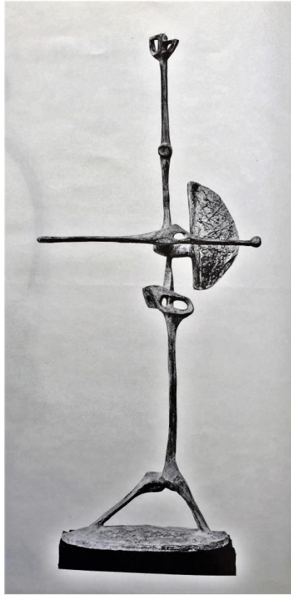
"Protector", 1970 bronze – 157 cm