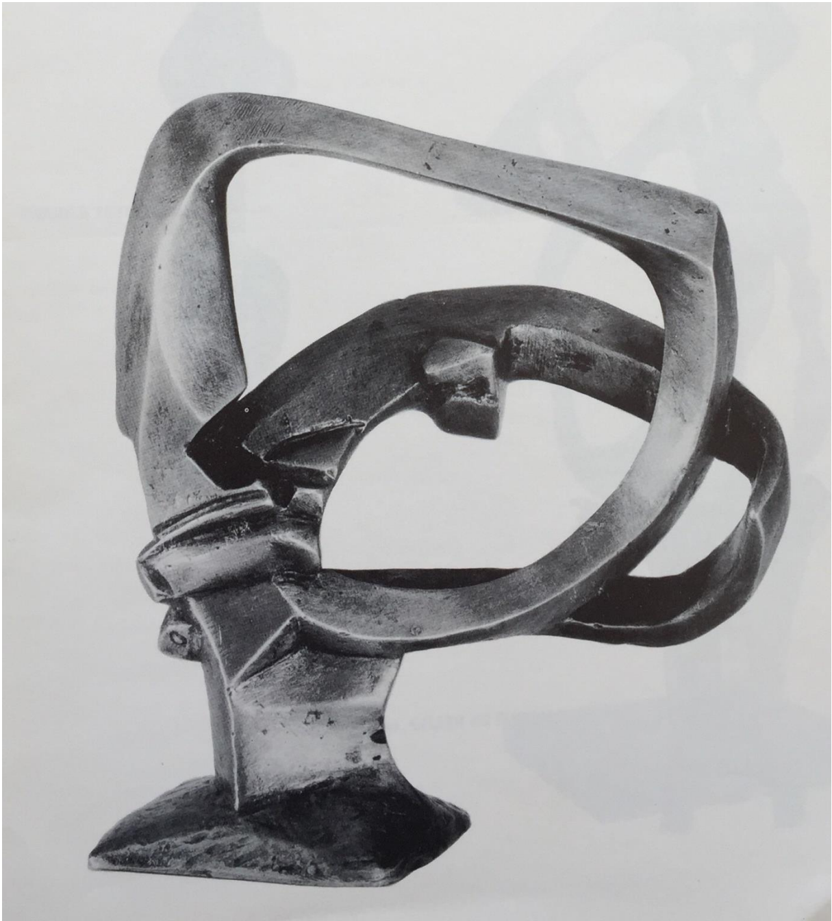
“Head” bronze - ed. 35 – 14x12 cm

Galerie La Motte Geneva – 27 th February to 16 th March, 1973