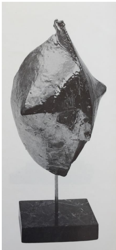
Pendant in relief