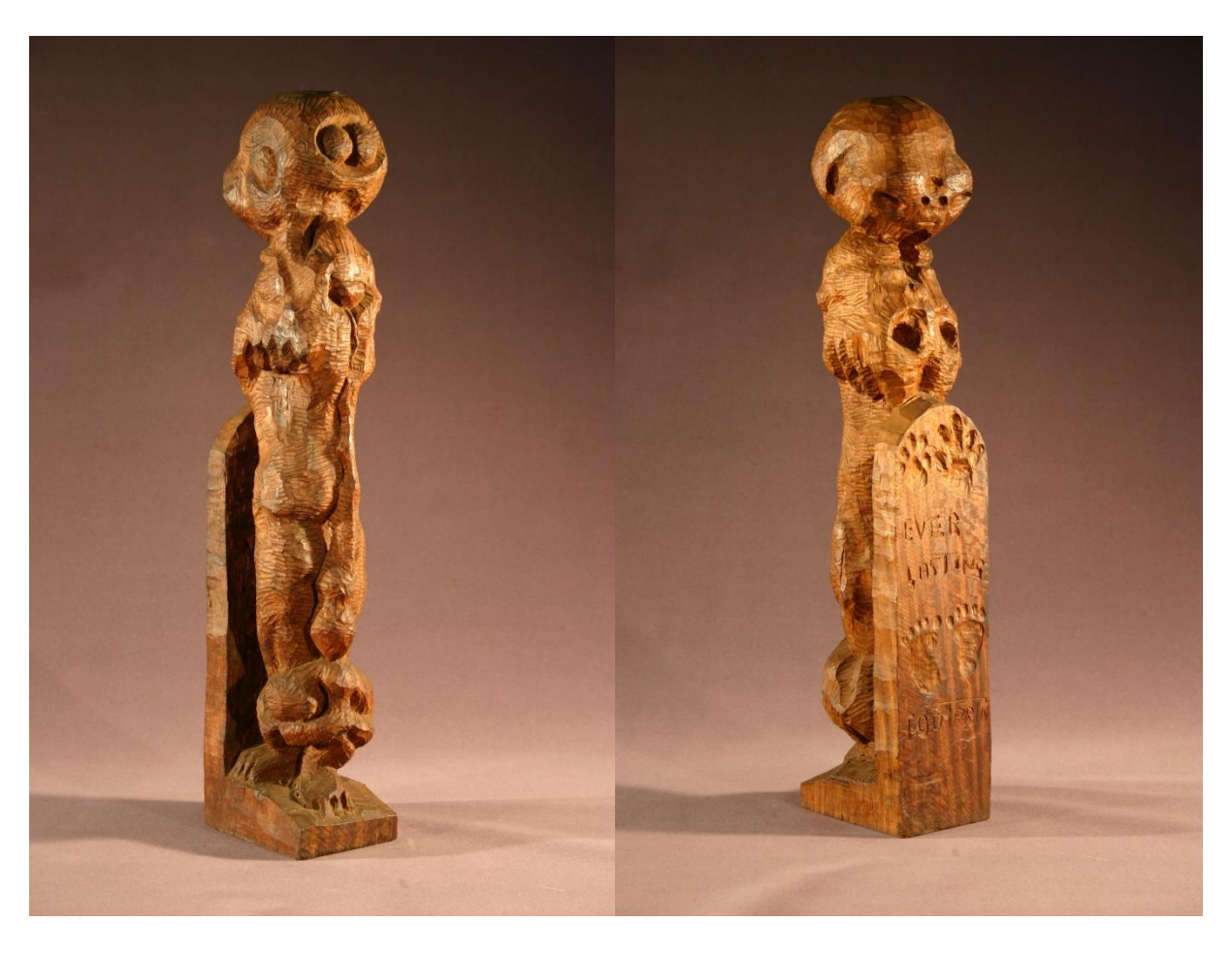
"Everlasting footsteps" – wood 61x9.6x13.6 cm (3 views)

Collection: WAM – Wits Art Museum – Johannesburg – Acc. 1994.11.03 DAG2006exh_94