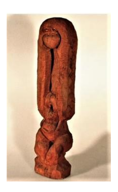
"True love" – Rhodesian teak – 60.8x16.4x15.9 cm

Collection: WAM – Wits Art Museum – Johannesburg – Acc. 1994.11.02 DAG2006exh_96