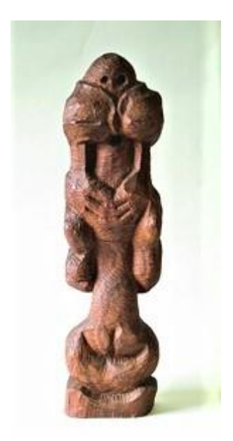
"It's painful" – Rhodesian teak – 49x14x9 cm

Collection: WAM – Wits Art Museum – Johannesburg – Acc. 1994.11.03 DAG2006exh_94