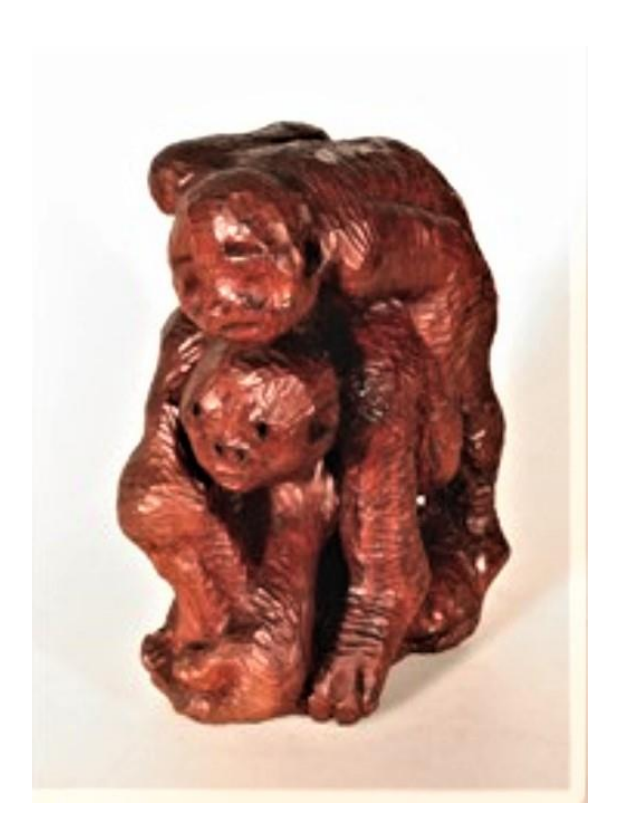
"Couple" ("Two figures"), 1971 – Rhodesian teak – 33x26x14 cm – Private Collection - DAG2006exh_82