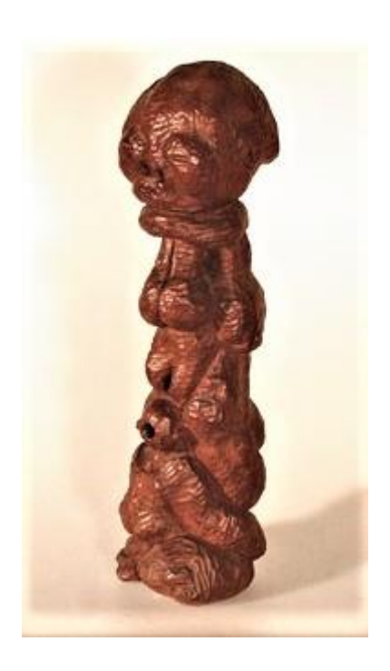
"Adult and child" – Rhodesian teak – 51.5x12.3x14.9 cm

Collection: Johannesburg Art Gallery, Johannesburg – Acc. 2002.04.56 DAG2006exh_92