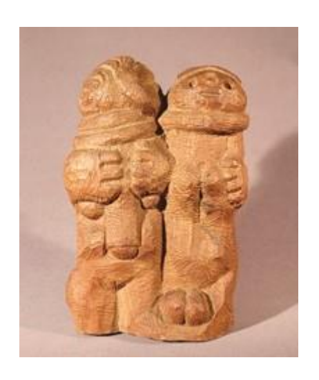
"Long Journey" – Rhodesian teak – 37x25x13 cm

Collection: WAM – Wits Art Museum – Johannesburg – Acc. 1994.11.02 DAG2006exh_96