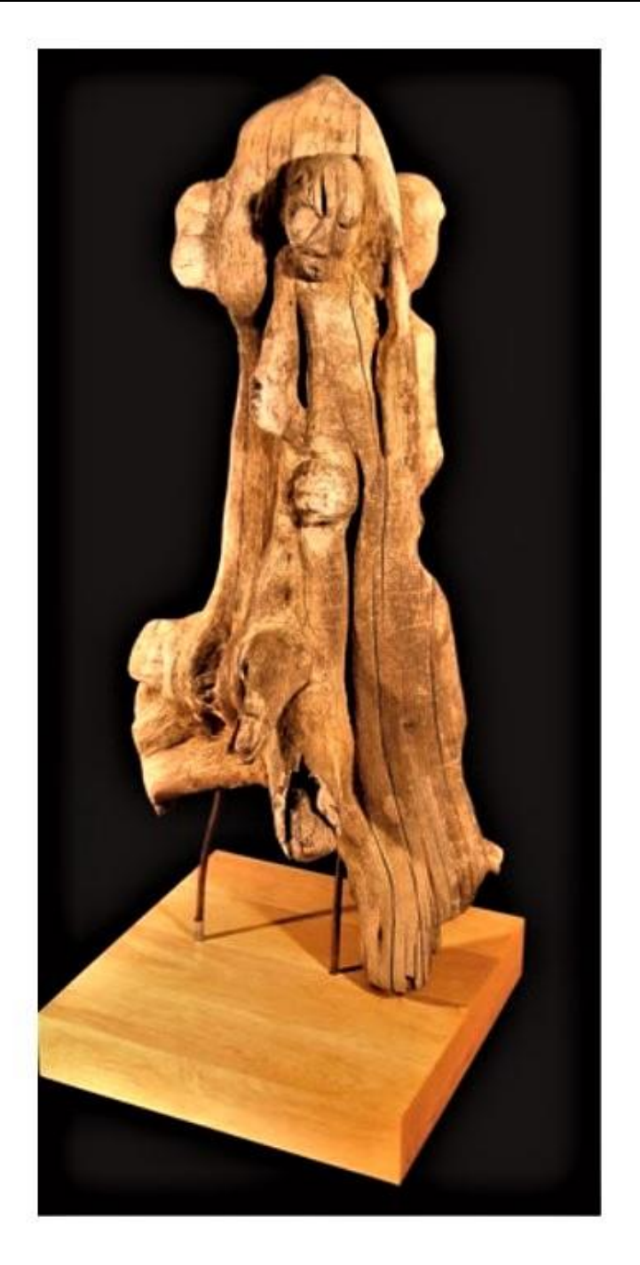
"Untitled" ("The spirits") – wood (unfinished) – 130x66x71 cm – Coll. Shilakoe family – DAG2006exh_81