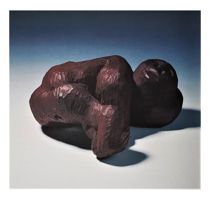
"Lying Mother", abt. 1971 - wood - 13x26x27 \ cm - Coll. GENCOR Johannesburg Illustrated in "Contemporary South African Art" – The Gencor Collection (Geers) (Jonathan Ball Publ.),