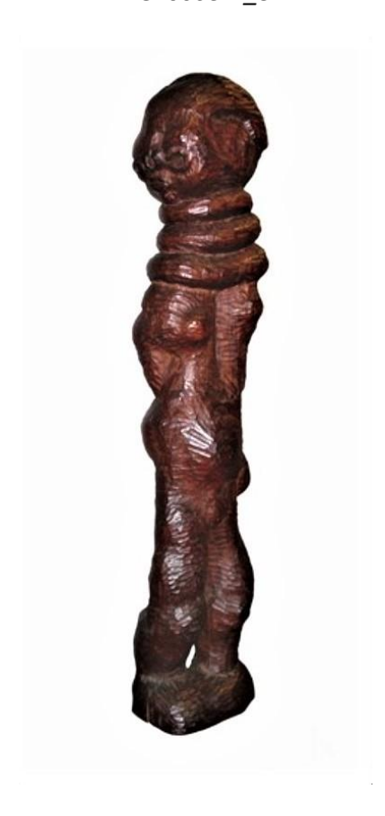
"Ndebele Totem Figure", 1971 – Rhodesian teak – 60.5x13x14 cm – Coll.: BHP Billiton - DAG2006exh_83