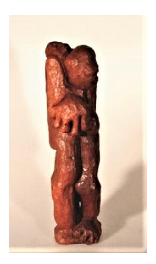
"What can we do?", 1971/72 – Rhodesian teak - 50.5x14.5x14.1 cm (Private Collection) DAG2006exh_86