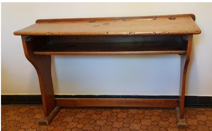
Yellow wood writing desk

Acquired from "Old Johannesburg", Rosebank, Johannesburg