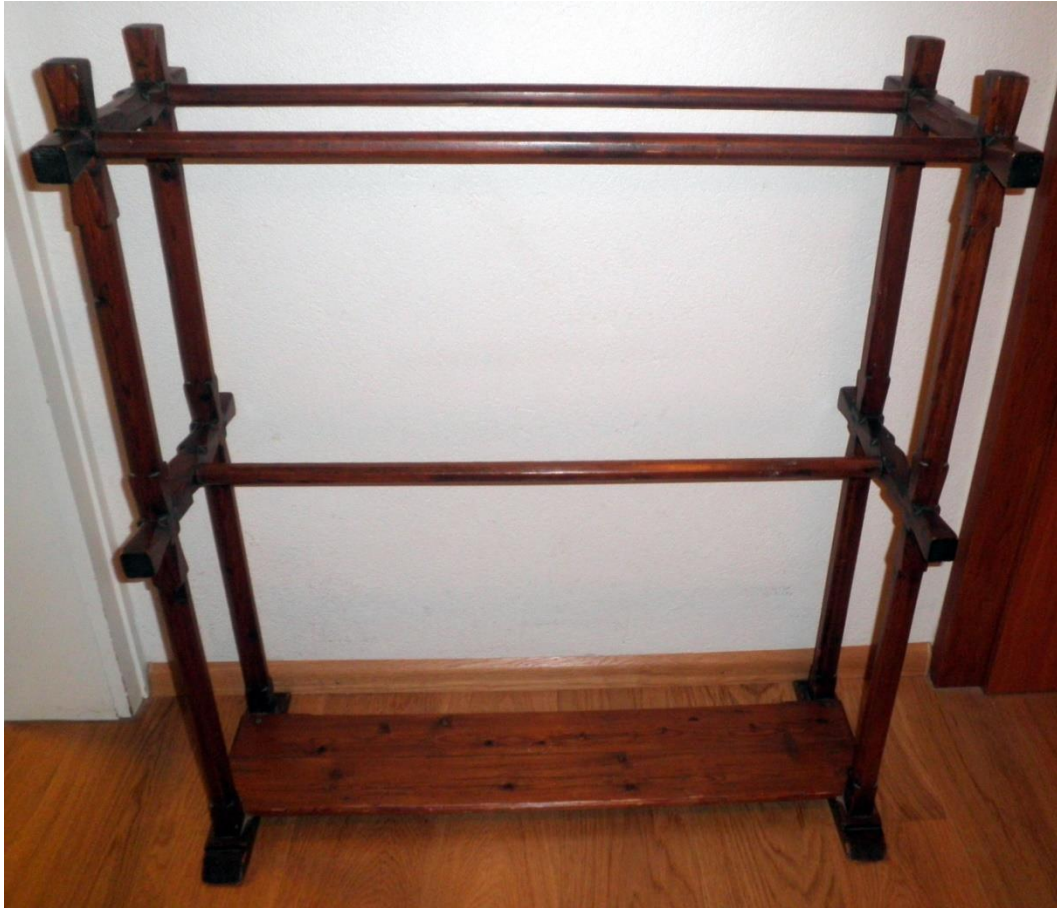
A hardwood and Oregon pine towel rail, early 20 th c.