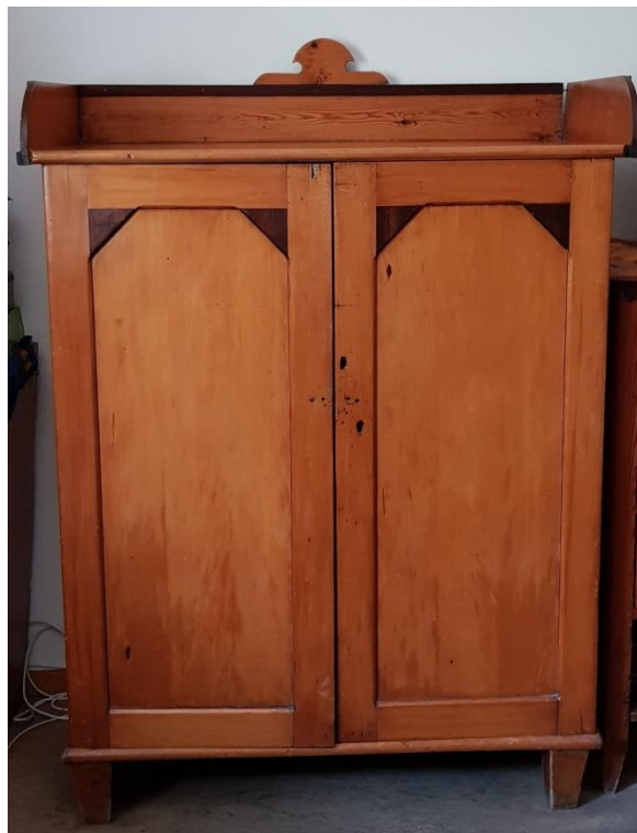
A Cape yellow wood, stinkwood and Oregon pine cupboard, 4 th quarter 19 th c.