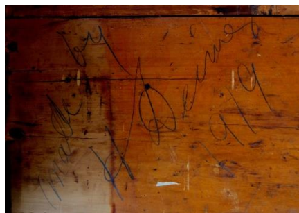
Signed and dated 1919 below left drawer