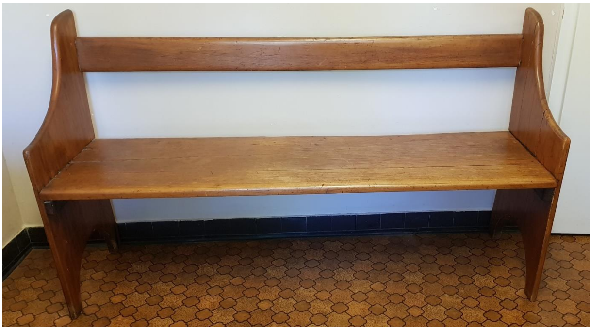
Yellow wood Church bench