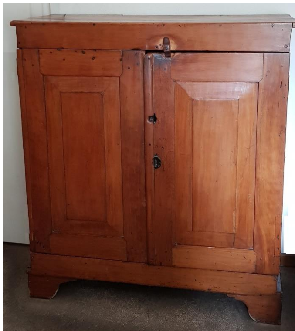
Yellow wood dress cupboard