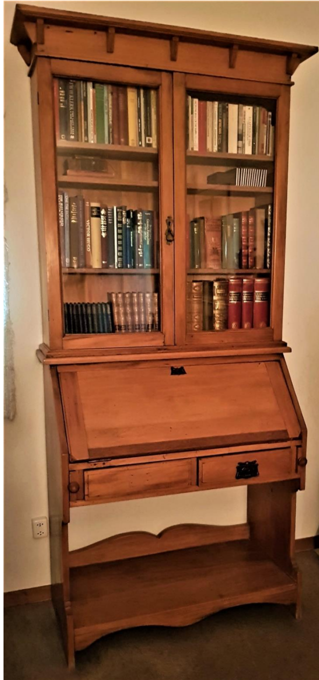
Yellow wood secretaire – two parts