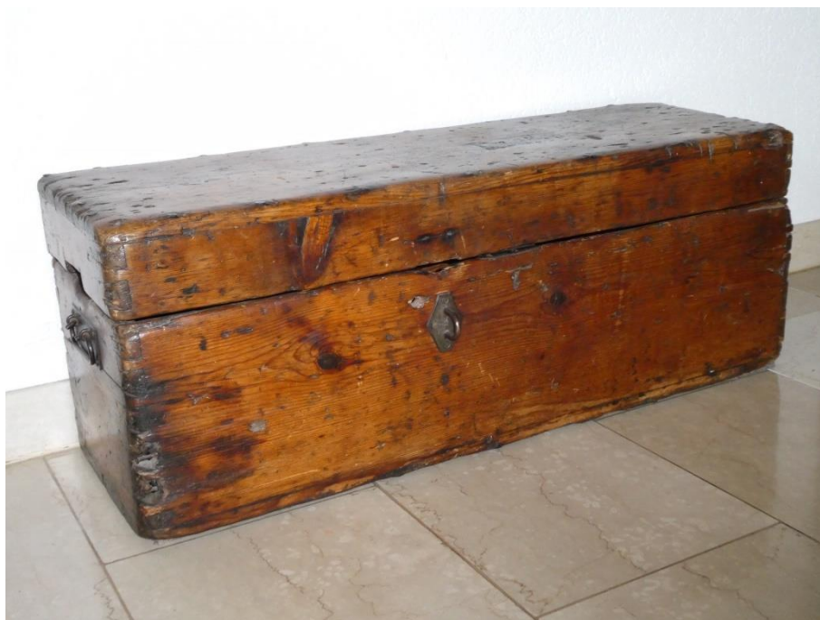
An Oregon Pine Kist, late 19 th / early 20 th c.

Acquired by Gallery 101 Johannesburg mid 1960s from Rusbank Gallery, Worcester