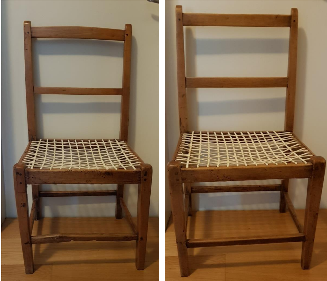
Cape lemoenhout chairs, West Coast, with rimpies, second half 19 th c.