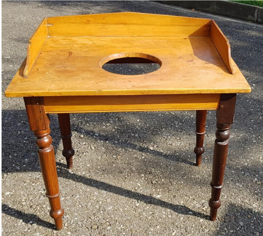
Yellow wood and stinkwood wastafel