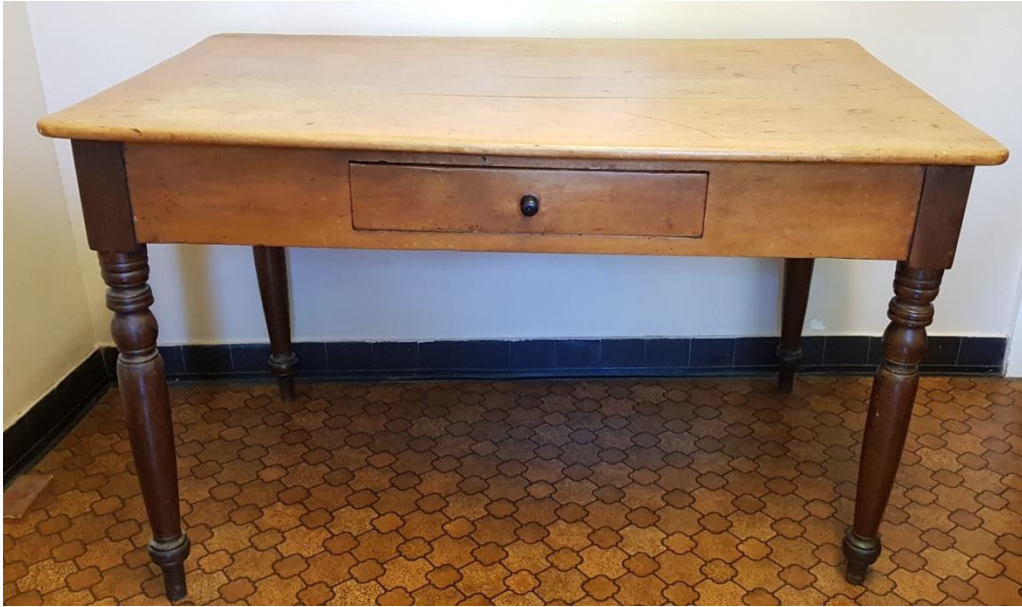
Yellow wood kitchen table with stinkwood legs