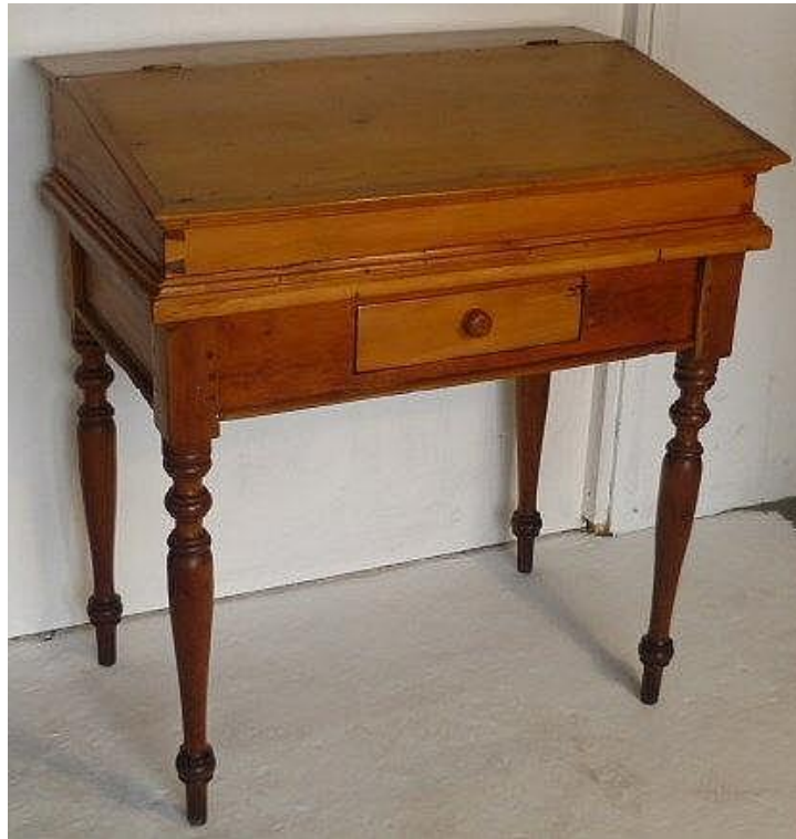
Yellow wood bible desk from a private collection in SA/UK, ex Gallery 101, Johannesburg (Auctioned by Barnes, 8 th February, 2014, Lot 52)

"Cape Antique Furniture" (van Onselen, Lennox) (Howard Timmins (1959)