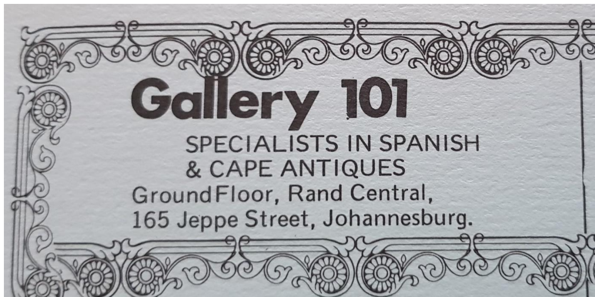
Advertisement in ARTLOOK 45 Johannesburg – August, 1970