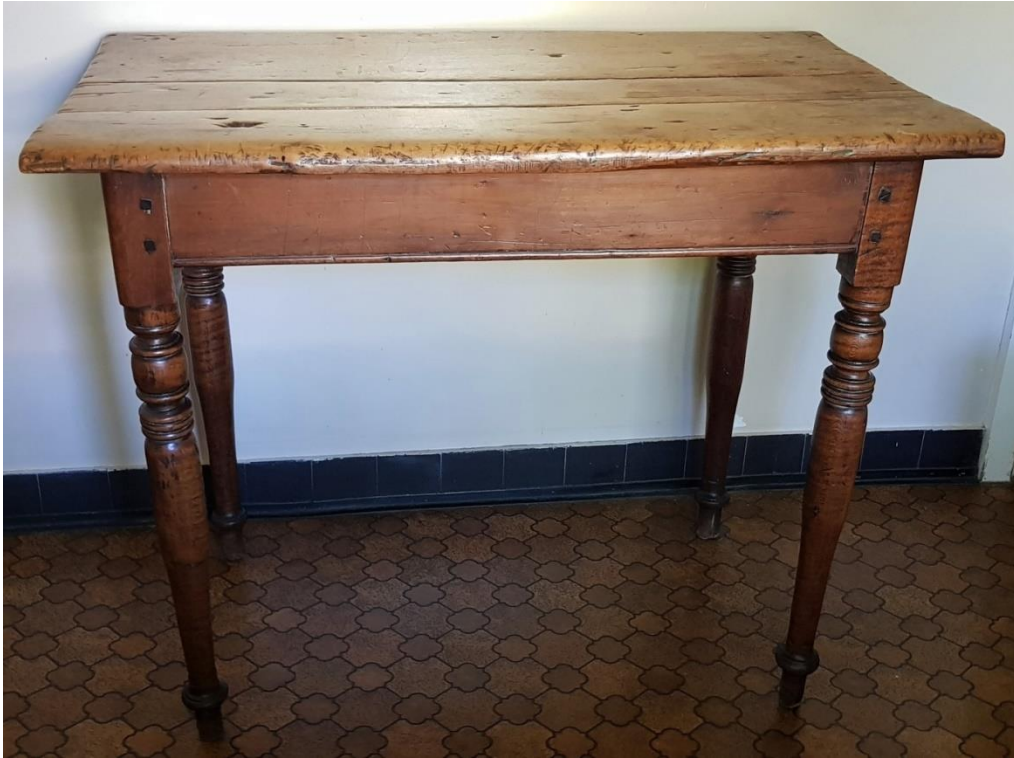
Cape antique table in yellowwood and stinkwood