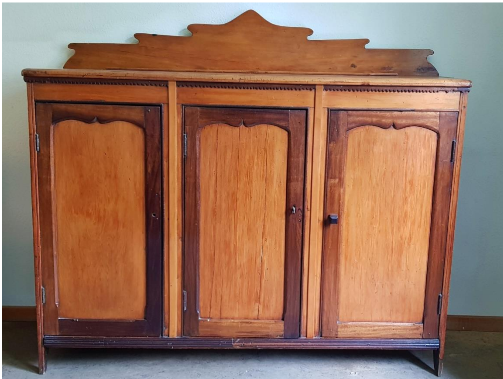
Cape yellow wood and stinkwood sideboard, 3 rd quarter 19 th c.

Acquired from "Old Johannesburg", Rosebank, Johannesburg