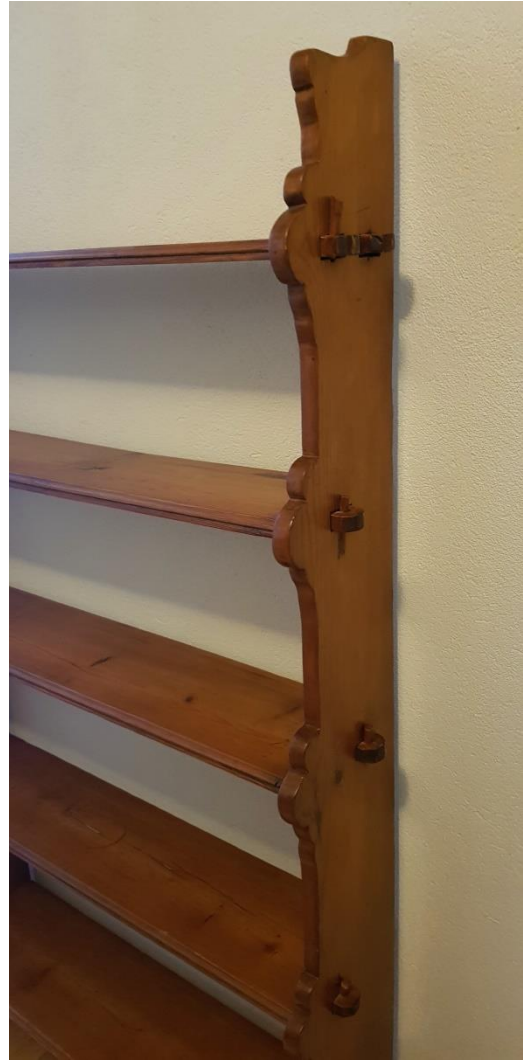
Antique yellow wood bookshelf

Acquired from "Old Johannesburg", Rosebank, Johannesburg