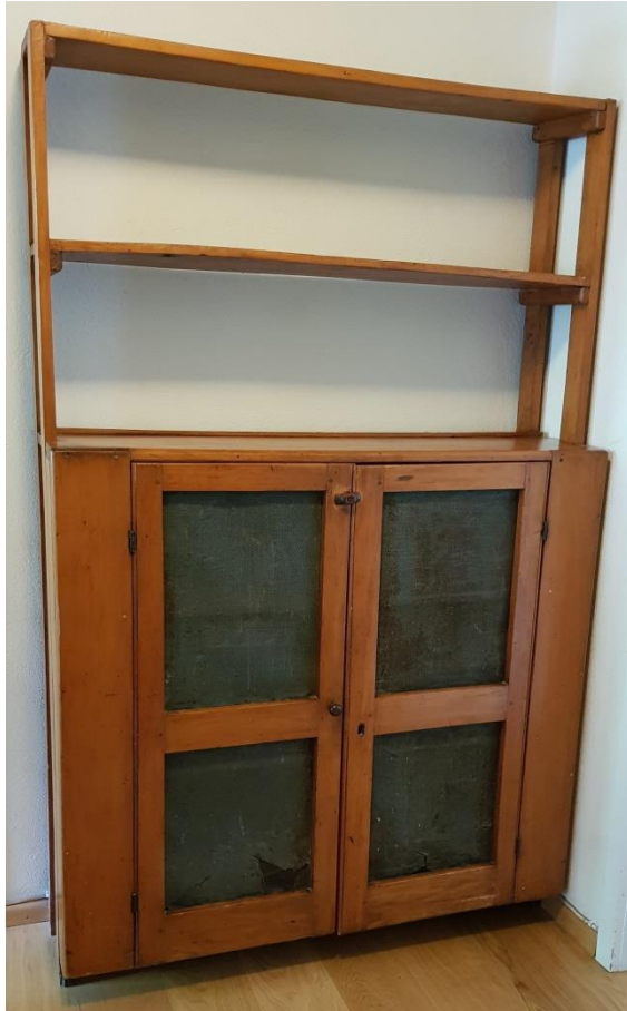
Yellow wood kitchen cupboard with original wire mesh Acquired from "The Mixer" Melville, Johannesburg, 1979