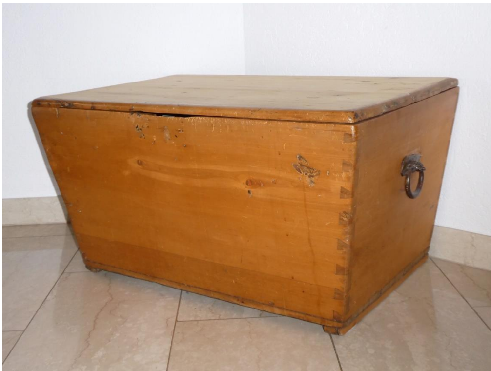
A Cape Yellow wood "Wakis" mid-19 th Century

Acquired by Gallery 101, Johannesburg, from Rusbank Gallery, Worcester, mid-1960s