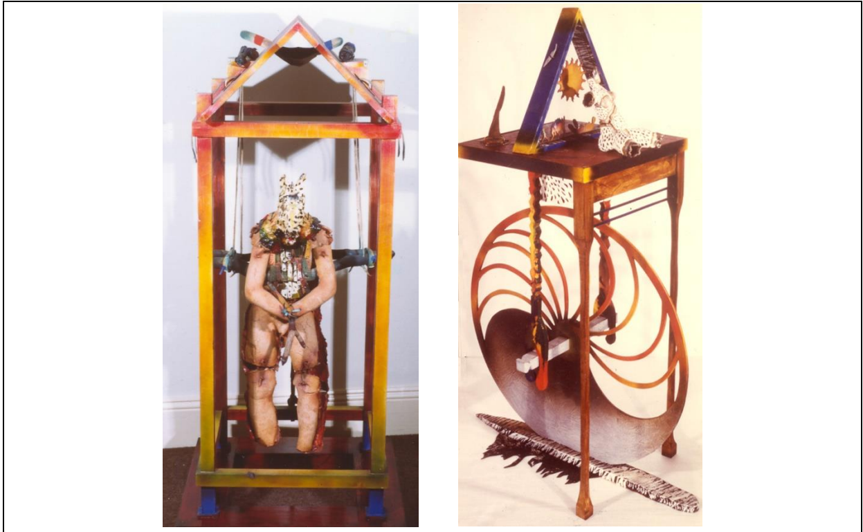
"Holding the secret of the Wish fulfilling Golden Gem", 1984 – ADVI 84/03 (at left)

http://www.pelmama.org/DeVILLIERS_Adrian_ADVI8403.htm