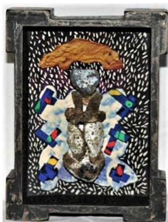
"Rain Queen", 1986 – mixed media panel – 25x18x7.5 cm

http://www.pelmama.org/DeVILLIERS_Adrian_ADVI8501.htm